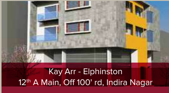
Kay Arr - Elphinston 12 th A Main, Off 100' rd, Indira Nagar