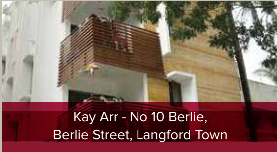
Kay Arr - No 10 Berlie, Berlie Street, Langford Town