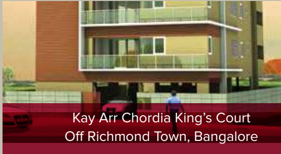
Kay Arr Chordia King's Court Off Richmond Town, Bangalore