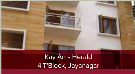
4 T 'Block, Jayanagar