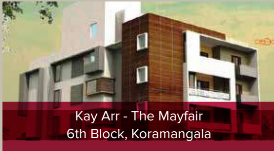
Kay Arr - The Mayfair 6th Block, Koramangala