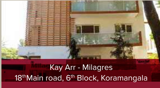
Kay Arr - Milagres 18 th Main road, 6 th Block, Koramangala