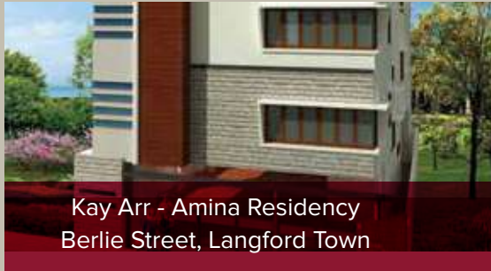
Kay Arr - Amina Residency Berlie Street, Langford Town